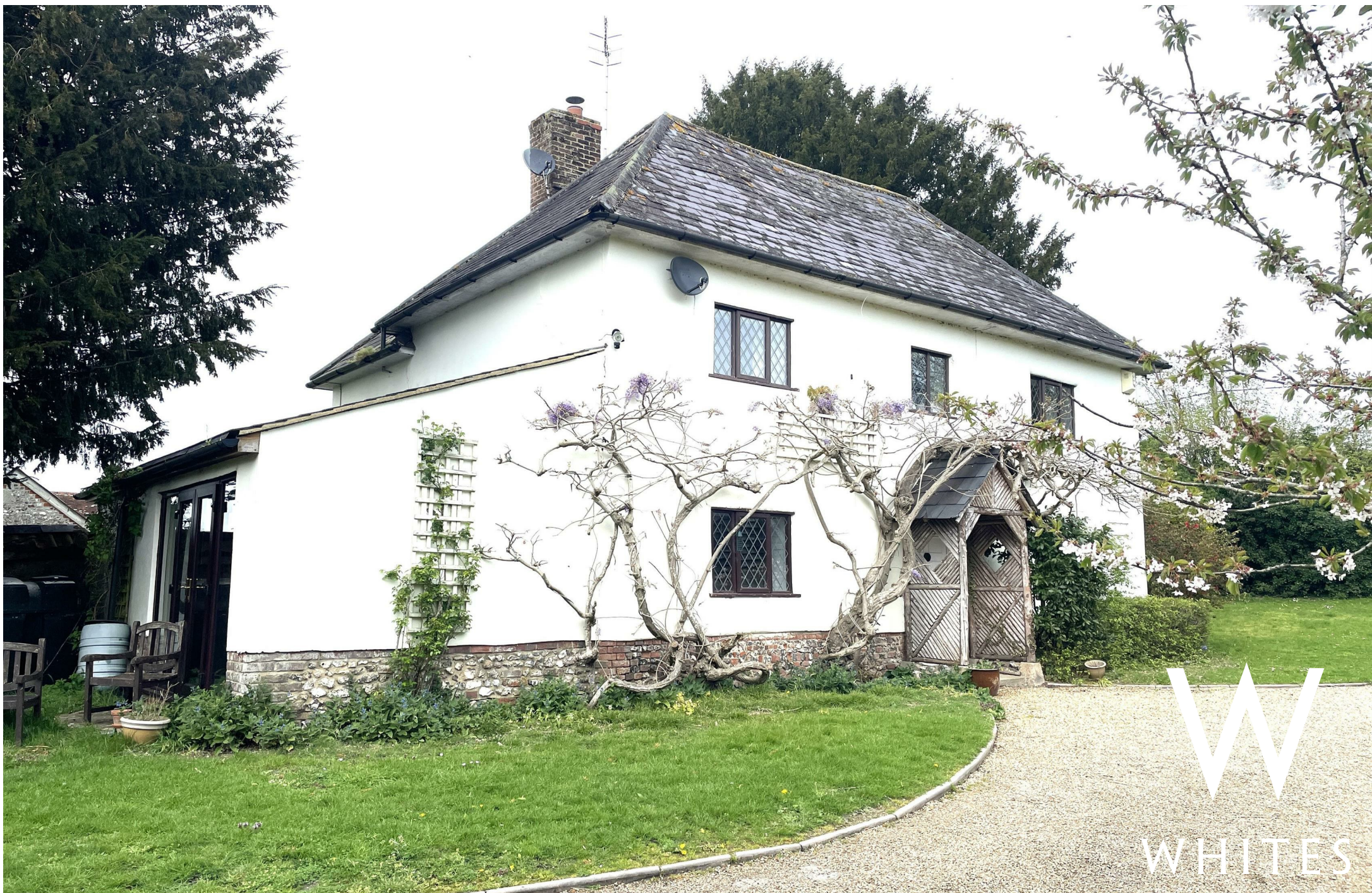
Primrose Cottage, Netton, Salisbury, Wiltshire, SP4 6AW